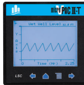
Wet Well Trend Screen