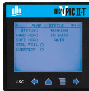
Pump Status Screen