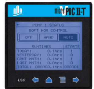
Pump HOA and Runtimes