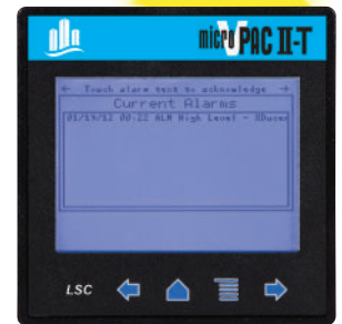
Current Alarm Screen