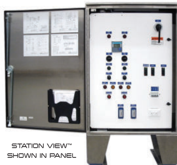
STATION VIEW™ SHOWN IN PANEL