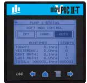
Pump HOA and Runtimes