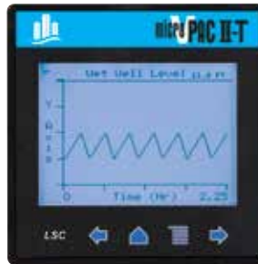
Wet Well Trend Screen