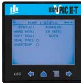
Pump Status Screen