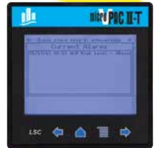
Current Alarm Screen